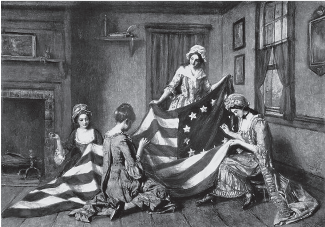
Henry MOSLER, Betsy Ross sewing the first American flag , oil on canvas, 1911